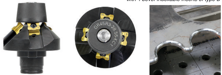
fig. 45°-radius-milling head with 4 cutting edges and guide roller, equipped with 4 x 3 mm-radius-indexable inserts of type R-K