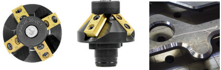
fig. 45°-bevel-milling head with 4 cutting edges and guide roller, equipped with 4 bevel-indexable inserts of type D

For each milling head (bevel, radius), specially coordinated guide rollers are offered. These guide rollers also enable the machining of inner and outer contours and boreholes.