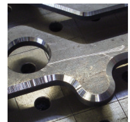
fig. 45°-bevel-milling head with 3x3 cutting edges and guide roller, equipped with 9 bevel-indexable inserts of type K